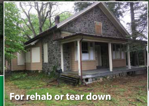
For rehab or tear down